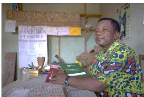
Left: More and better cocoa Right: Strong and professional Agripreneurs